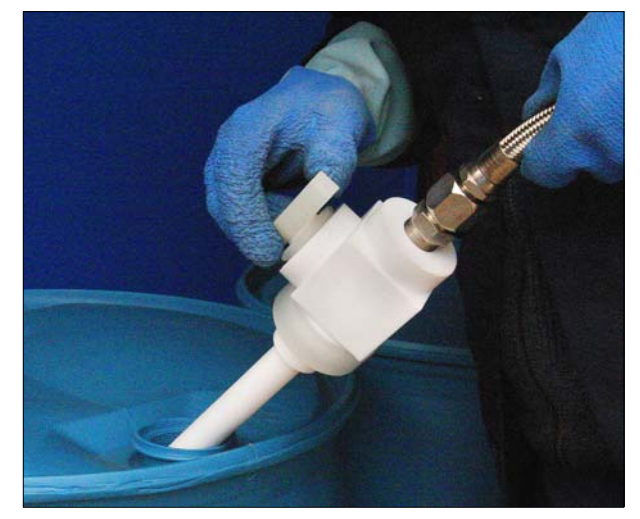
DM-1000HFR Nozzle with Teflon Spout